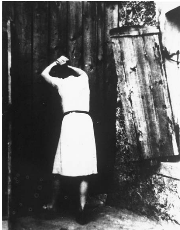
Woman about to be killed by Germans, Šiauliai ghetto, ca. 1941–1944.