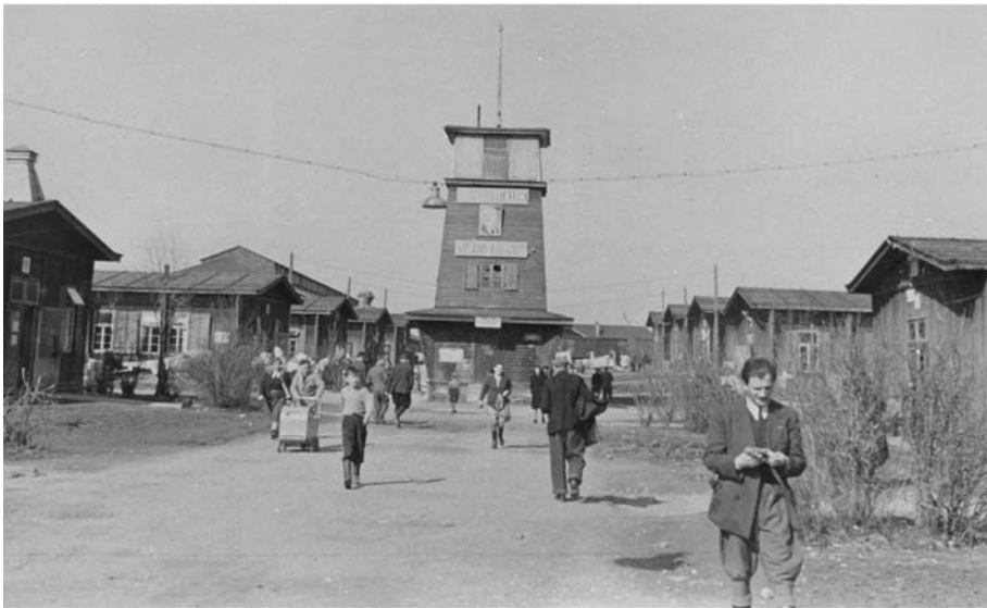
The Feldafing Displaced Persons Camp.

people listed more than one place of origin) in Lithuania, most far removed from the cities of Kaunas and Vilnius. Nearly seven decades later, the Leyb Koniuchowsky Papers constitute a vital—and still largely unexamined—source for historians.