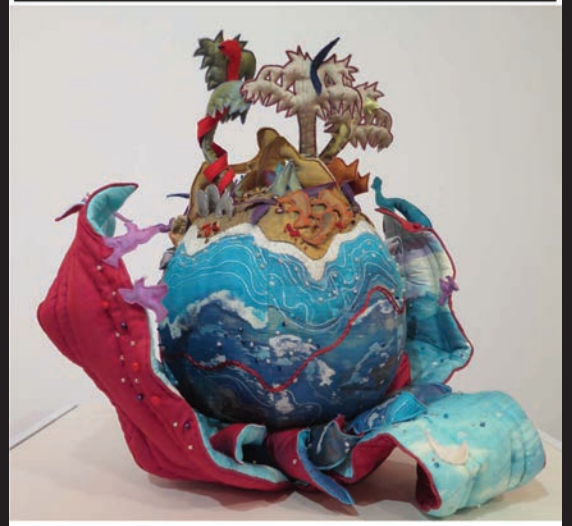
Ina Golub's fiber sculpture, Let There Be, on view in Uncommon Threads, YU Museum's newest exhibition

THE SHINE ONLINE EDUCATIONAL SERIES AT YIVO PRESENTS